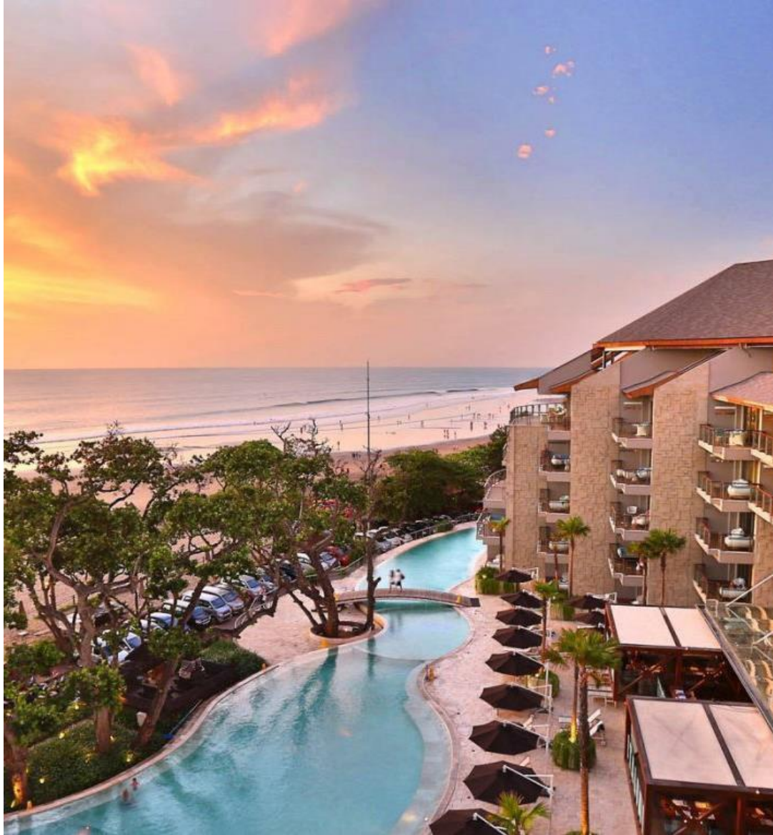
Double Six Luxury Hotel Semniyak at Semniyak