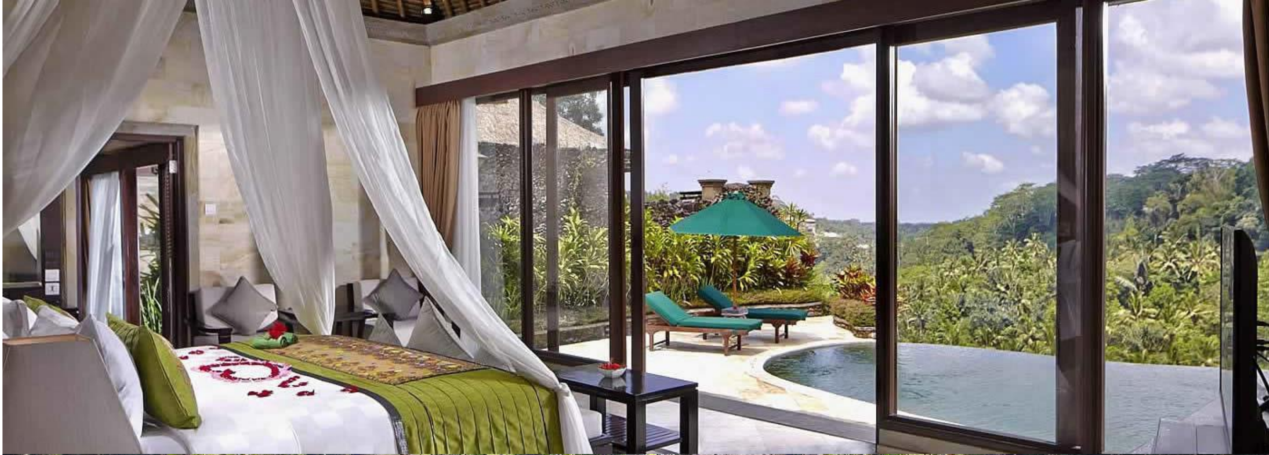
ROYAL PITAMAH 1 BEDROOM POOL VILLA