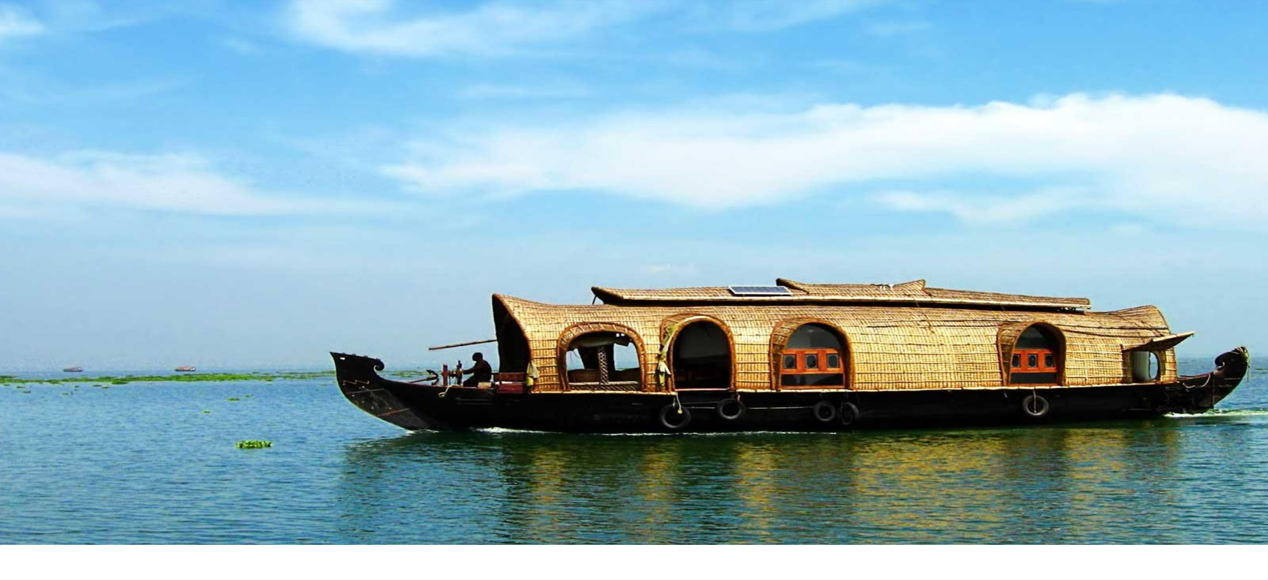
<u>DAY 04: THEKKADY – KUMARAKOM</u> Well here comes the time to explore the famous backwaters and beach life of Kerala and make the most of the day.