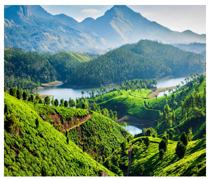
DAY 02 : MUNNAR LOCAL SIGHTSEEING

On Arrival at Cochin Airport - You will be greeted by our representative and transfer to your resort Munnar. Munnar a hill station located 1600 meters above sea level. Once the summer resort of the erstwhile British administration in South India it still retains its colonial charm and is famous for its tea plantations, rolling hills, picture postcard hamlets and undulating valleys. Check into your Resort and unwind.