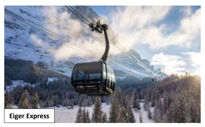
Day 6 Highlight of the tour, A magical alpine excursion to the top of Europe - the amazing Jungfraujoch and scenic Interlaken.

Get set for a memorable magical alpine excursion to Jungfraujoch – The Top of Europe, a high–point of your tour. First we proceed to Grindelwald Terminal. The new 3S-Bahn Eiger Express takes you from the Grindelwald Terminal to the Eigergletscher station in just 15 minutes. There you board a cogwheel train to reach the highest railway station in Europe at 11,333 feet – a world of eternal ice and snow. Visit the Ice Palace where artistes create their work of art in ice. Visit the Sphinx