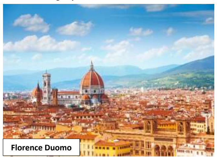
Day 9 Guided walking city tour of Florence. View the remarkable and famous Leaning Tower of Pisa.

This morning check out and drive to Florence – the cradle of the Renaissance. Along with your English-speaking local guide, walk and absorb into the culture of the historic city. View the Duomo – the city's most iconic landmark, the Campanile and the Baptistery with its Gates to Paradise. Also see the Piazza Della Signoria – an open-air museum crammed with Renaissance sculptures, edged by historic cafes and presided over by the magnificent Palazzo Vecchio and the famed Ponte Vecchio (bridge) across the River Arno. Next, drive to Piazzale Michelangelo to get a spectacular panoramic view of the city. Later proceed towards Pisa. On arrival see the