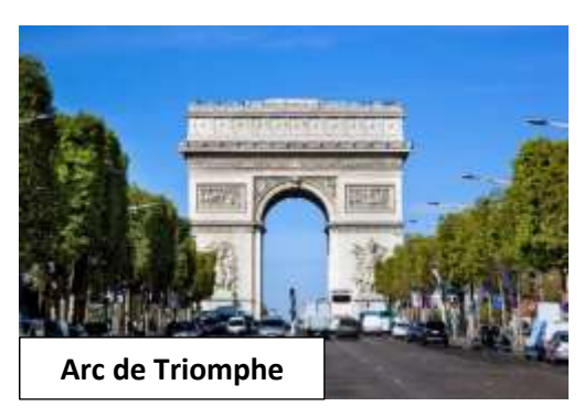
Day 2 Guided city tour of Paris. Visit to Eiffel tower 3rd (Top) Level. Take a funicular ride at Montmartre to see the Sacre-Coeur Basillica, the second most visited monument in Paris. Enjoy a romantic cruise on River Seine.

Today we proceed for a guided city tour of Paris. Marvel at the finest Parisian tourist attractions, Place Vendôme, Place de l'Opéra Garnier, Musée d'Orsay, Place de la Concorde, Champs Elysées, one of the most recognised fashionable avenues in the world, Arc de Triomphe, Alexander Bridge, Les Invalides