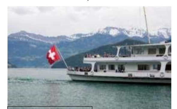
Day 7 Orientation tour of Lucerne. Cruise on Lake of Lucerne. Free time for shopping.

Check out from your hotel and proceed to experience the Olympics at close quarters and feel the Olympic spirit the way the athletes felt it, to study the history of the Games from antiquity to today - thanks to the latest computer technology and audio-visual media, all of this can be accomplished in the Olympic Museum. Later experience with an exhilarating tip to the top of Mt Titlis at 3020 metres on various cable cars including Rotair, the world's first revolving cable car. Get a breath taking unrestricted 360 degrees stunning view of the dazzling snow caped peak, deep crevasses and pristine white snow fields, dotted with massive ice boulders from every angle. Do not forget to visit the "Cliff Walk" the highest suspension bridge in Europe along the cliff of Mt.Titlis. Later proceed on an orientation tour of Lucerne one of most beautiful cities in Switzerland. Visit the Lion Monument, Kapell Brucke with some free time to shop for famous Swiss watches, knives and chocolates.