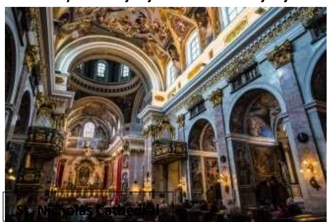
Day 5 Guided city tour of Ljubljana. Funicular to Ljubljana Castle. Visit Lake Bled.

This morning proceed for the guided city tour of Ljubljana See its picturesque bridges across the river Ljubljanica, the St. Nicholas Cathedral and the famous Dragon Bridge and Triple Bridges. Also, visit the Central Market at Pogacarjev Square to experience the energy of the city. Later proceed next to Ljubljana Castle by enjoying the funicular to till the top. Later proceed to Lake Bled. See the main attraction which surrounds Bled Island. The island has several buildings, the main one being the Gothic church